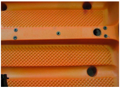
Step 3. Fit well-nuts into the 9mm holes.

(Tip: If a 35mm holesaw is not available, drill a series of holes inside the scribed line with one of the aforementioned drill bits, remove plastic and file the hole out to 35mm)