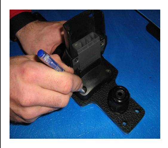
Step 5: Prepare plastic base to fit FF bracket:

§ Position FF bracket on plastic base and mark locations for screw holes as shown.