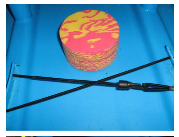
Step 10. Securing Battery