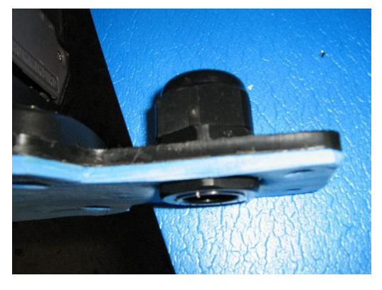
Step 4. Attach gland to base. Fully tighten bottom gland screw.

(Tip: Use the vise grip to hold bottom nut while tightening gland)